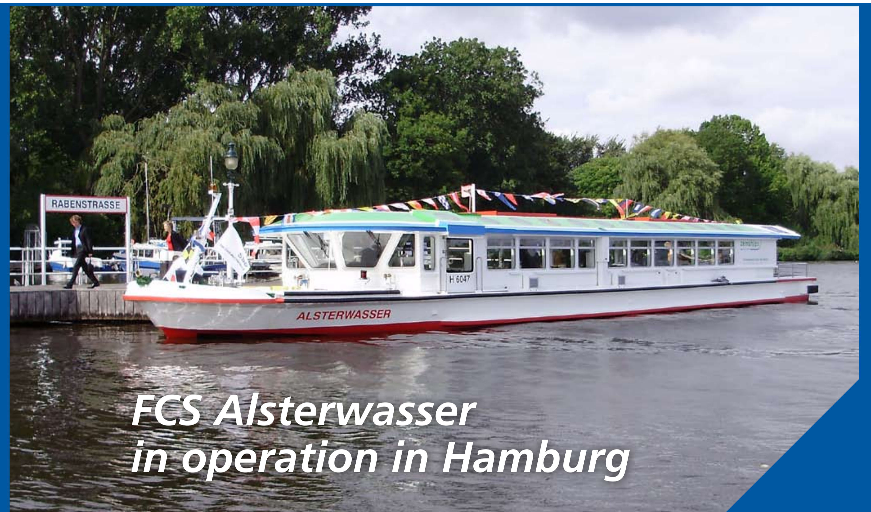
FCS Alsterwasser in operation in Hamburg